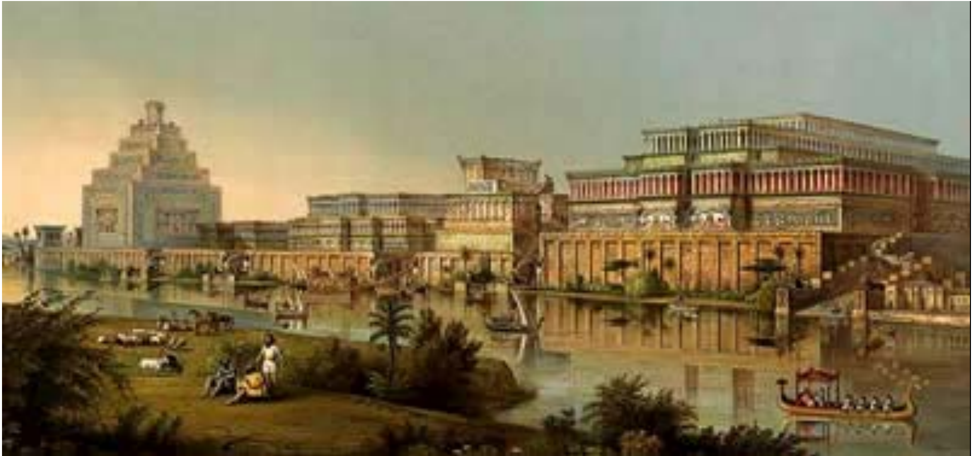
Artist's Painting Of Nineveh