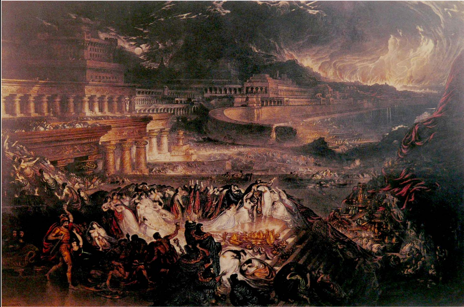
Destruction Of Nineveh