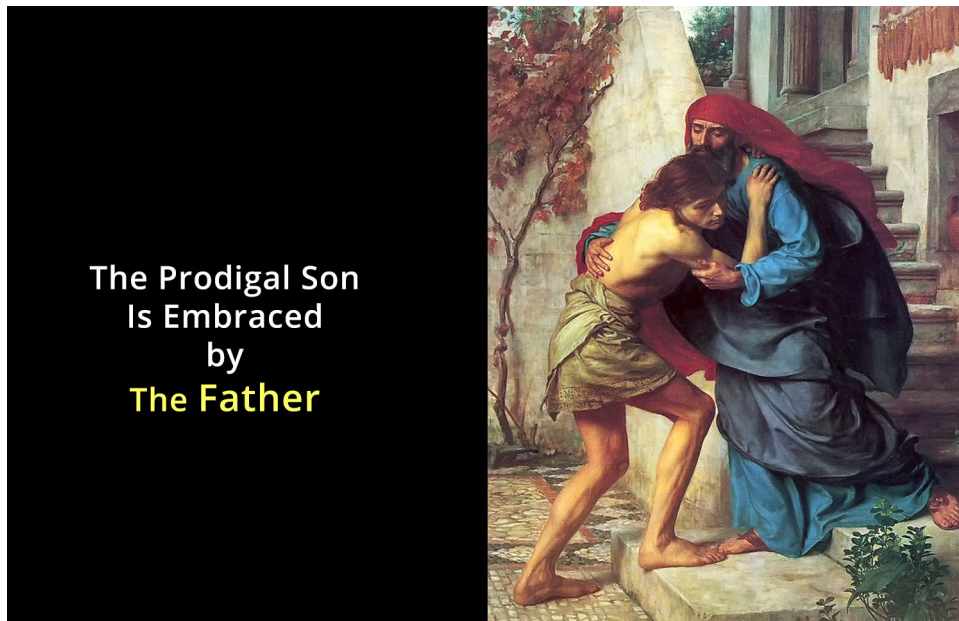
The Prodigal Son Is Embraced by The Father

And He said, “A man had two sons. The younger of them said to his father, ‘Father, give me the share of the estate that falls to me.’ So he divided his wealth between them.” Luke 15:11-12 (NASB)