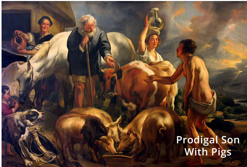
Prodigal Son With Pigs

The literal Greek for "came to his senses" means "into himself he came." This Hebrew expression, "came to his senses,"