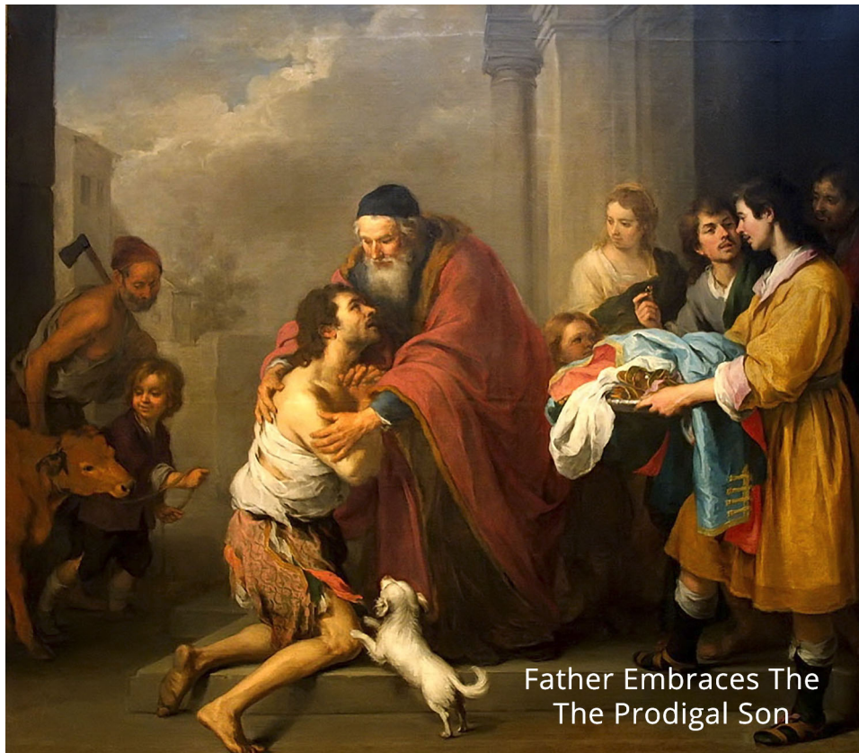
Father Embraces The The Prodigal Son

The father ordered a robe, a ring, and sandals to be brought for his son. Some propose that the robe is symbolic of notability. The ring symbolized authority and the sandals